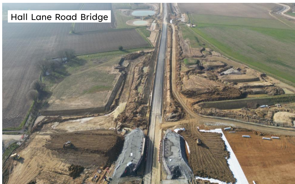
Hall Lane Road Bridge

At Hall Lane, the 8 reinforced concrete columns that provide the structural support for the bridge deck have now been surrounded by material, constructing reinforced earth embankments that are built up to the required height of the bridge abutments.