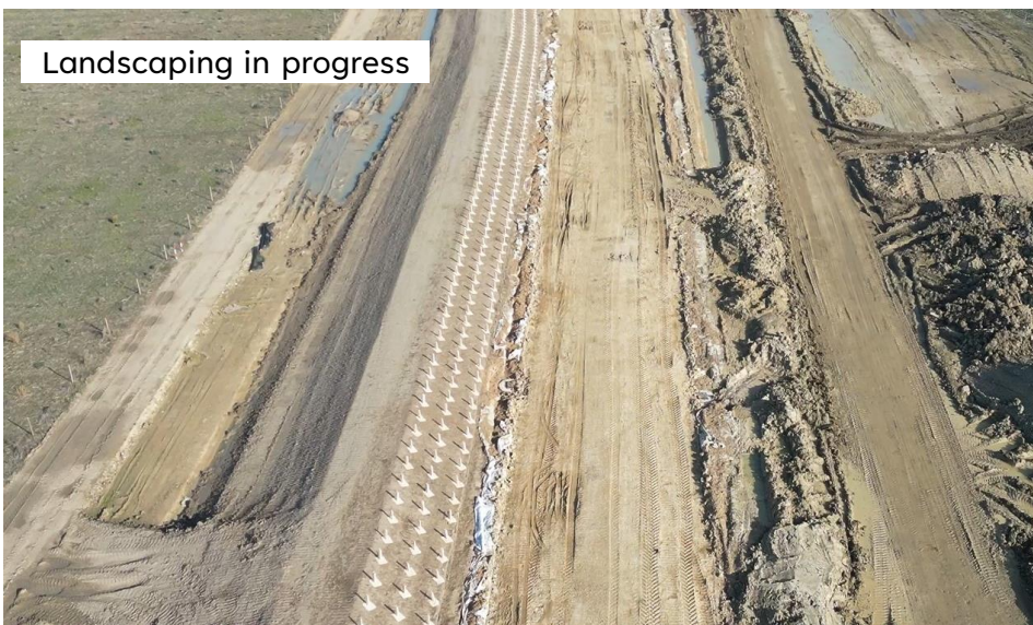
Landscaping in progress

In the coming weeks, a 300t crane will arrive to site in preparation for lifting the 10 pre-cast concrete beams on top of the structure. A working platform to accommodate for the loads produced by the 300T crane and beams has also been constructed in recent weeks. Once the beams are landed in place, works to pour the concrete for the reinforced bridge deck, waterproofing and wall drainage will commence.