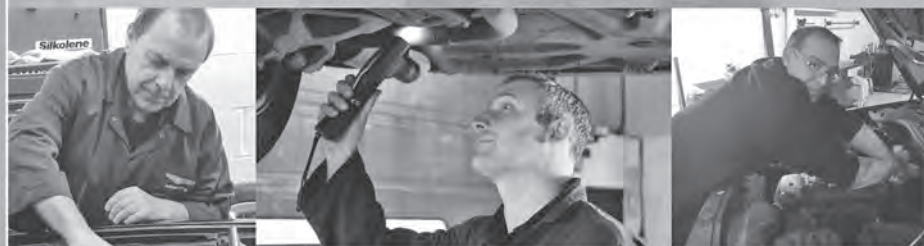
Friendly & experienced staff to look after you