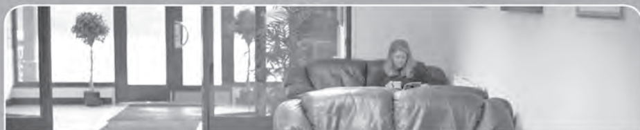
Comfortable waiting area